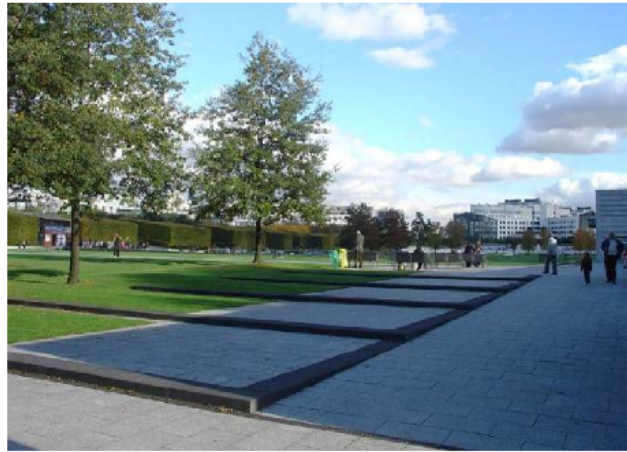
Fig. 2.2: Industrial sites after renovation