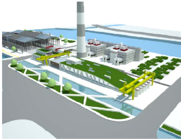
Fig. 2.5: Industrial model site II

tion and development of Sydney power plant renovation of Seattle gas, Vienna Gas Tank Museum renovation, renovation and reuse in Zurich, Switzerland Stephen Bruner mills reformation. At present, the world heritage of Europe is not only the church and other ancient buildings, including the ruins and industrial civilization, which only has three mining areas, located in Belgium, Germany and Sweden. Chinese are included in the world heritage the list of heritage projects are mostly archaeological sites, religious temples, imperial tombs and the royal garden. In 90s, due to the city the change and development of exhibition mode to speed up the construction speed, resulting in a century of industrial buildings and lots of decline. The transformation of city economy and lead to "update mode, and the transformation of the city will" retreat "is the decline of second industry industrial buildings and sites. An important object of the transformation of the old city also includes industrial buildings and the objective of the overall planning area. Shanghai and Nanjing have been developed; Shanghai and Nanjing have been developed; Shanghai will put the function replacement 66.2 square kilometres of industrial land. By 2010, 66.2 square kilometres of industrial land reserved for 1/3, 1/3 to third of industrial land, the last 1/3 transfer to the suburbs and outer suburbs.