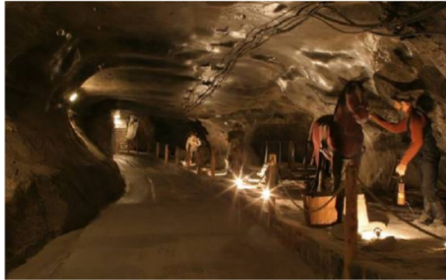
Fig. 2.1: Underground industrial site